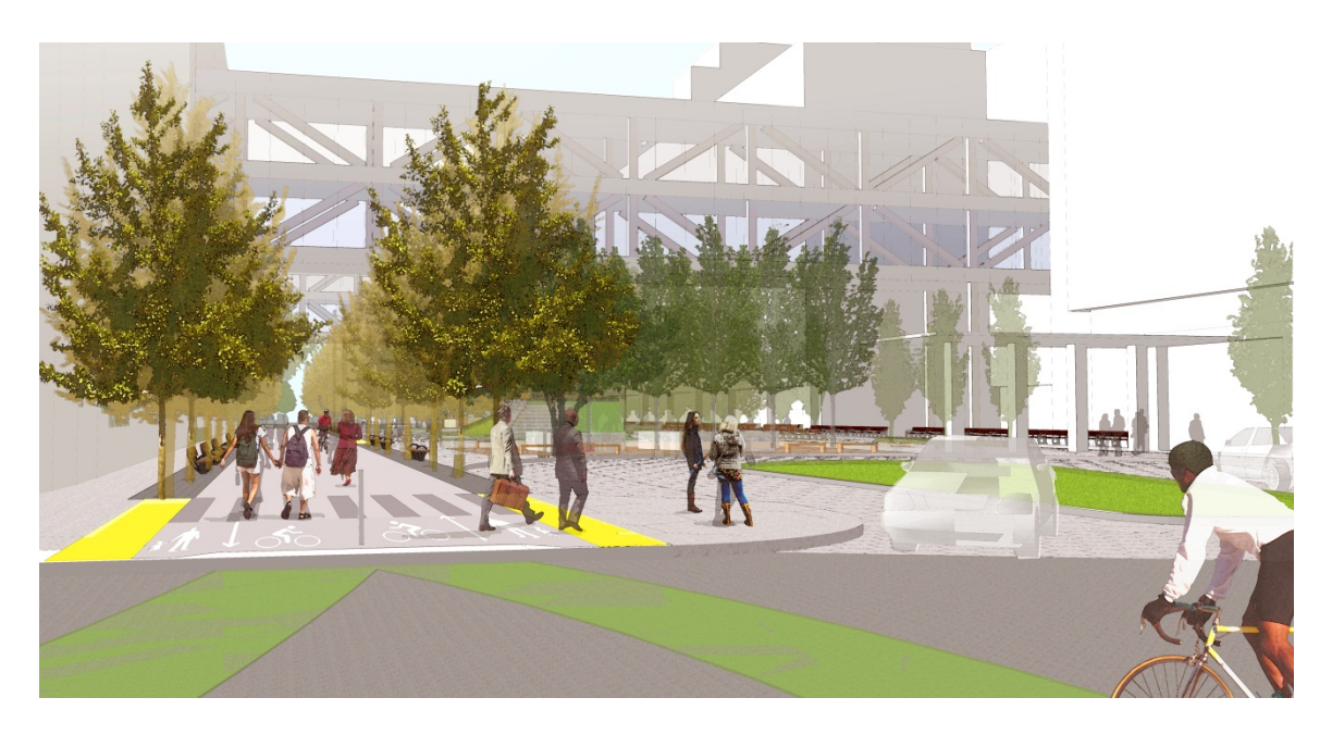
Figure 5-8 Looking north on Fourth Street