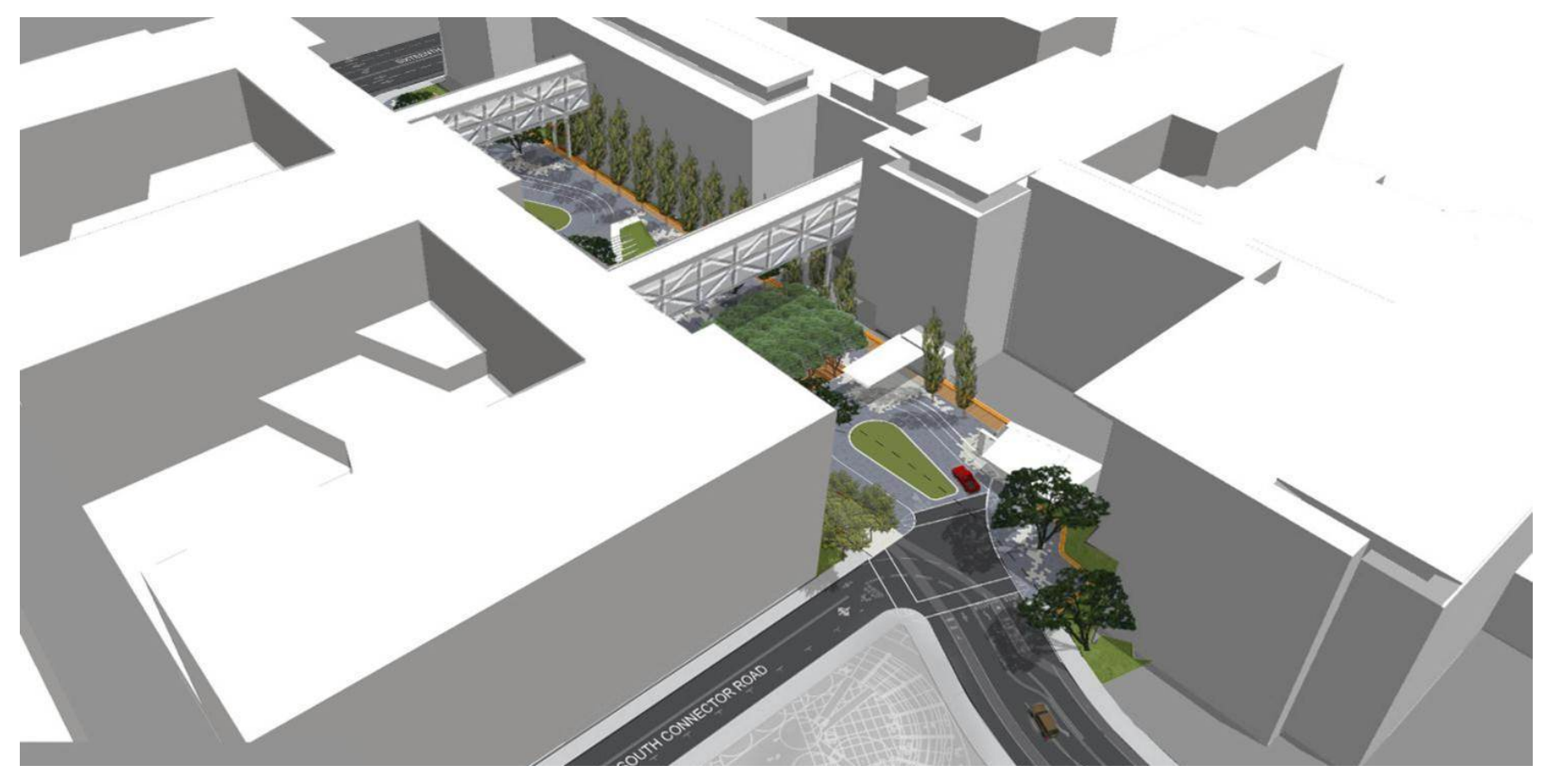
Figure 5-7 Phase II Bird's-eye View