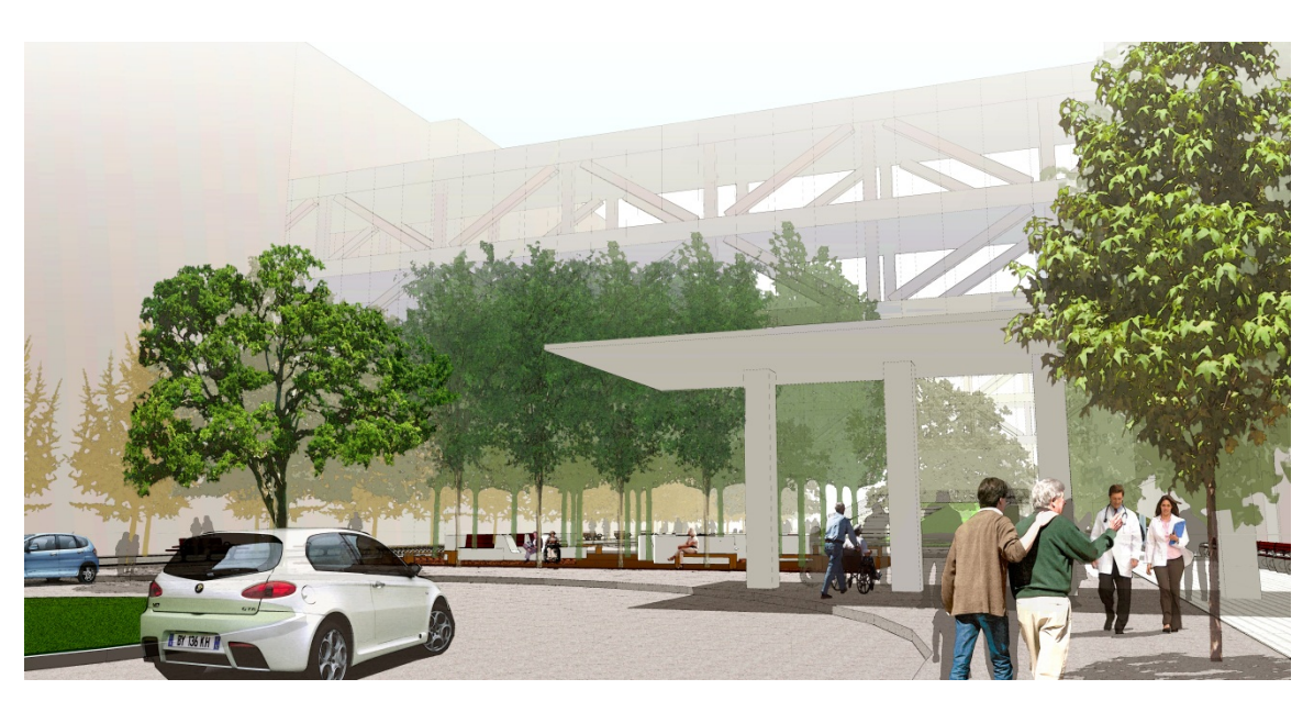
Figure 5-11 View of Grove from South Drop-off