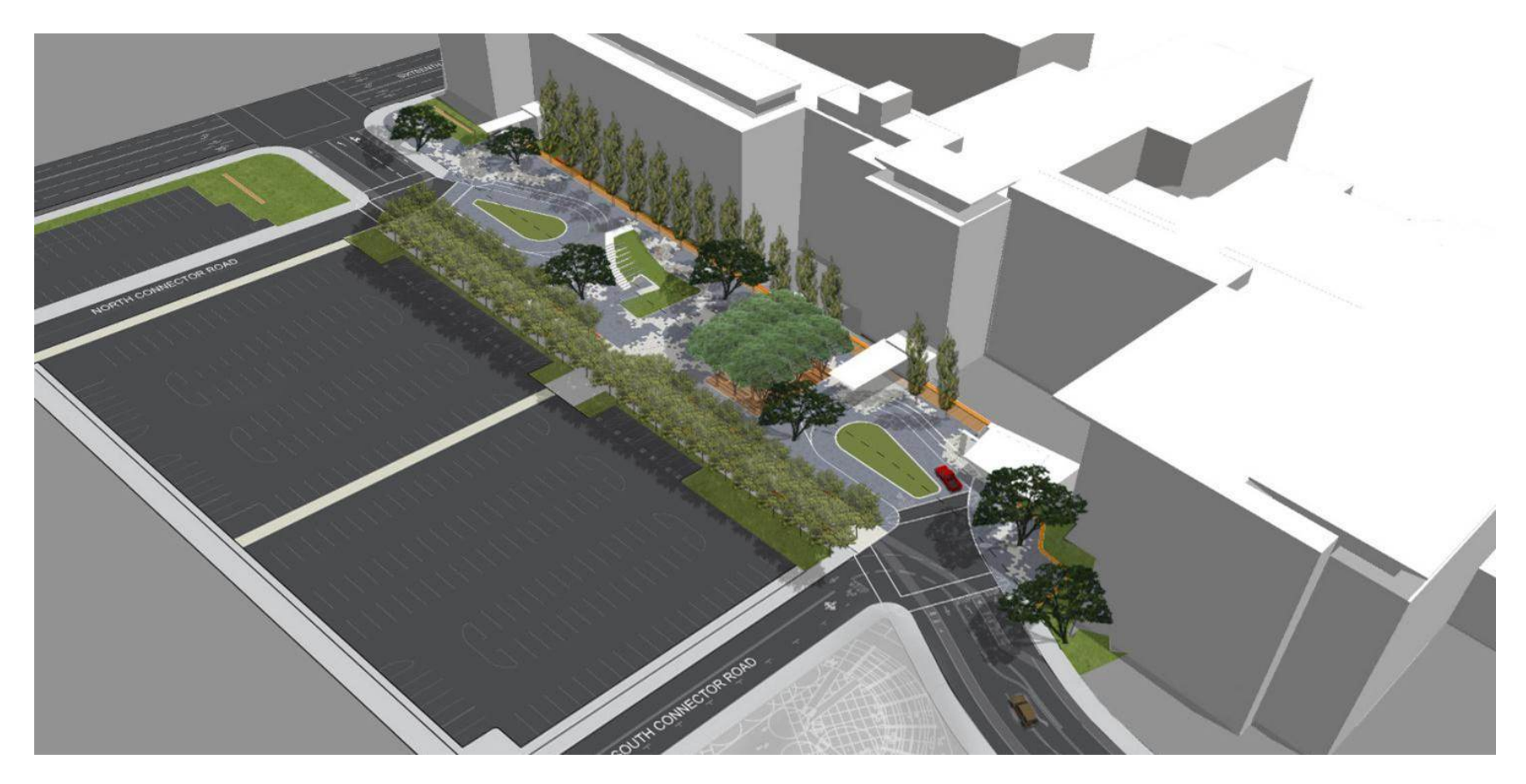
Figure 5-6 Phase I Bird's-eye View