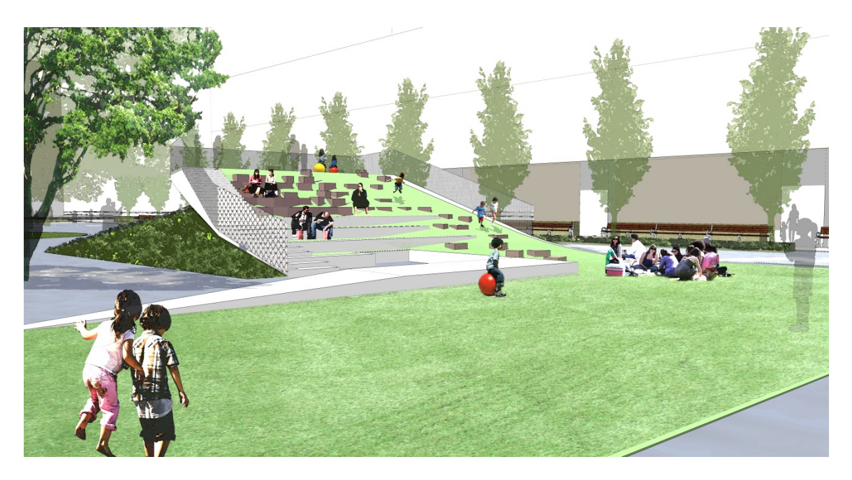
Figure 5-10 View of Amphitheater