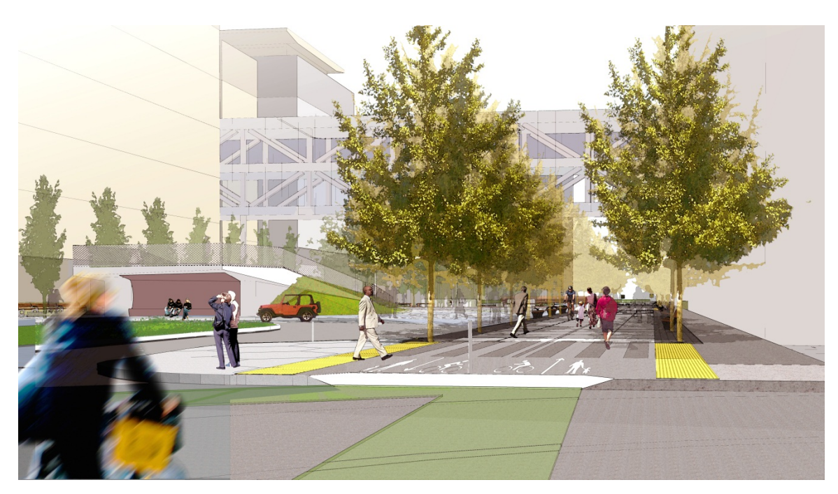
Figure 5-9 Looking south on Fourth Street