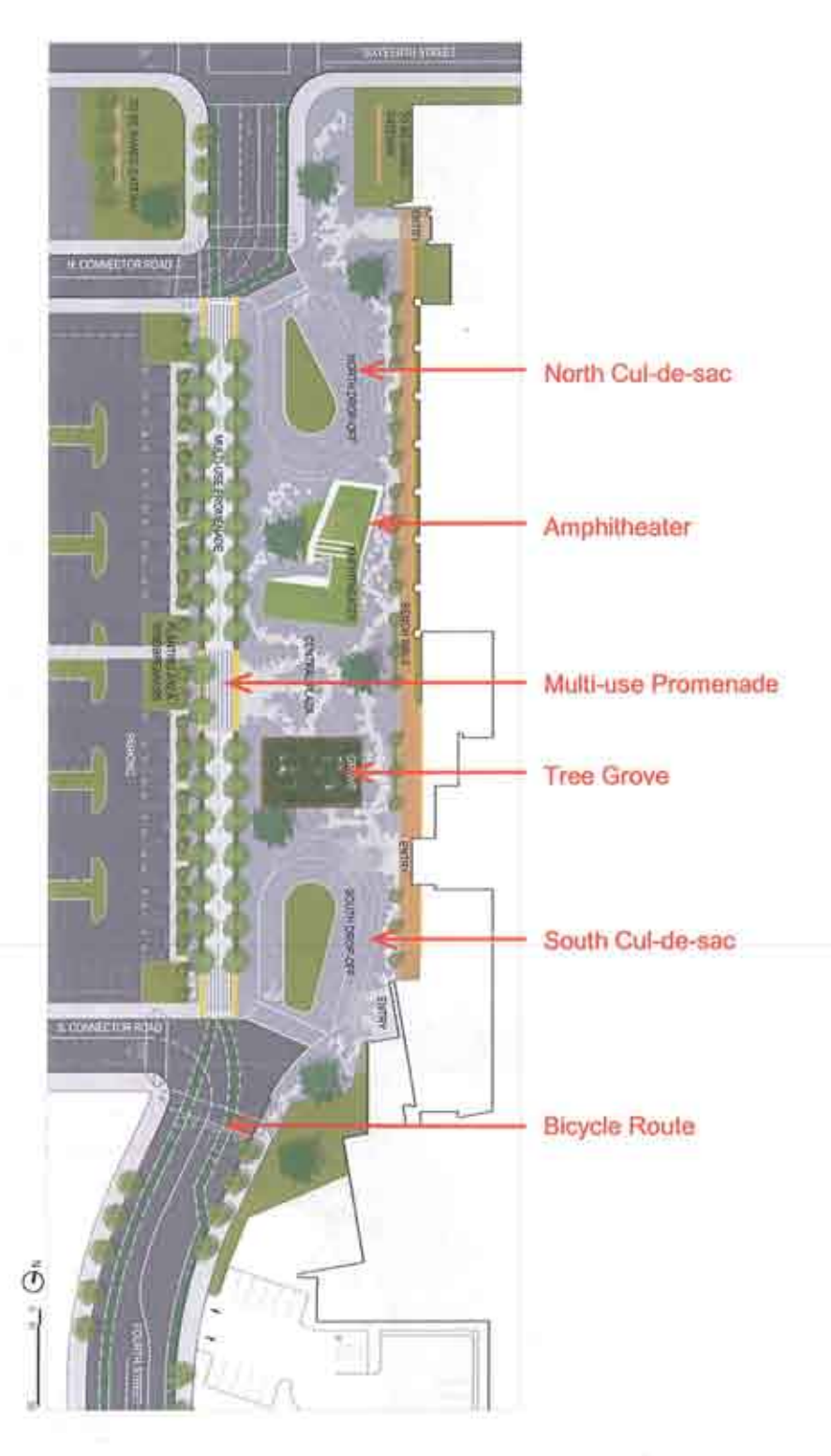
Figure 5-4 Proposed Phase I Plaza Concept Plan